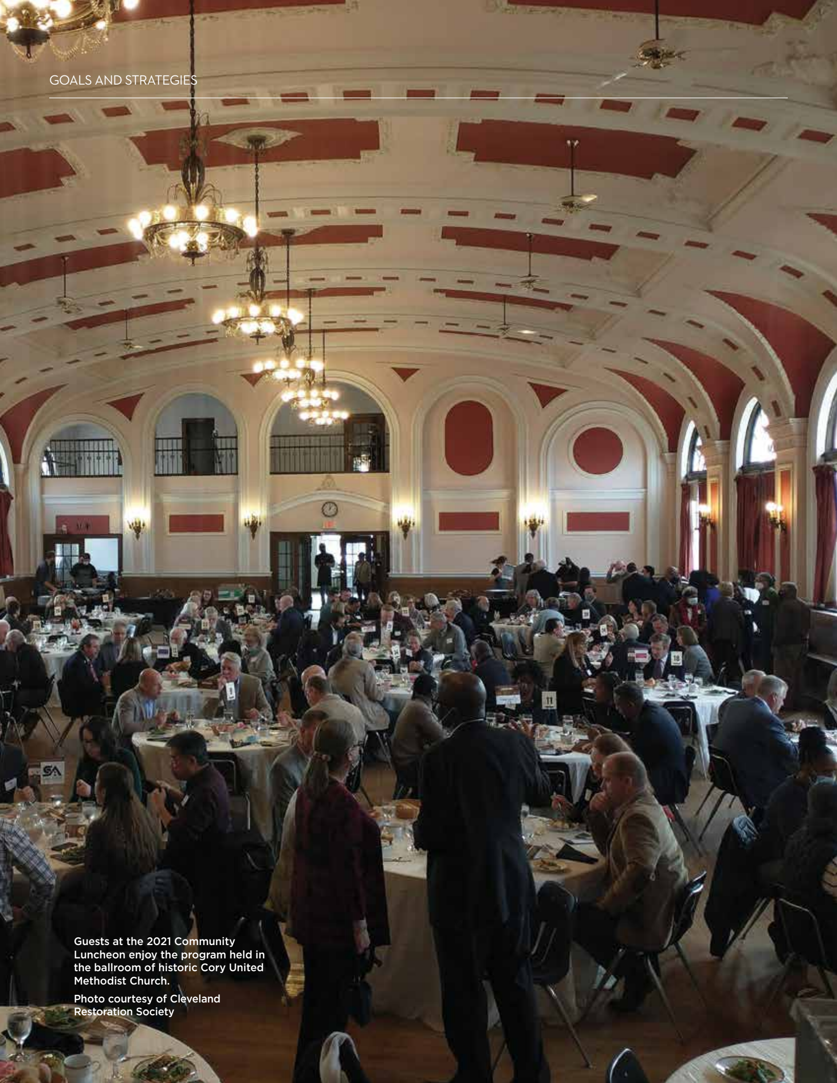
Guests at the 2021 Community Luncheon enjoy the program held in the ballroom of historic Cory United Methodist Church.