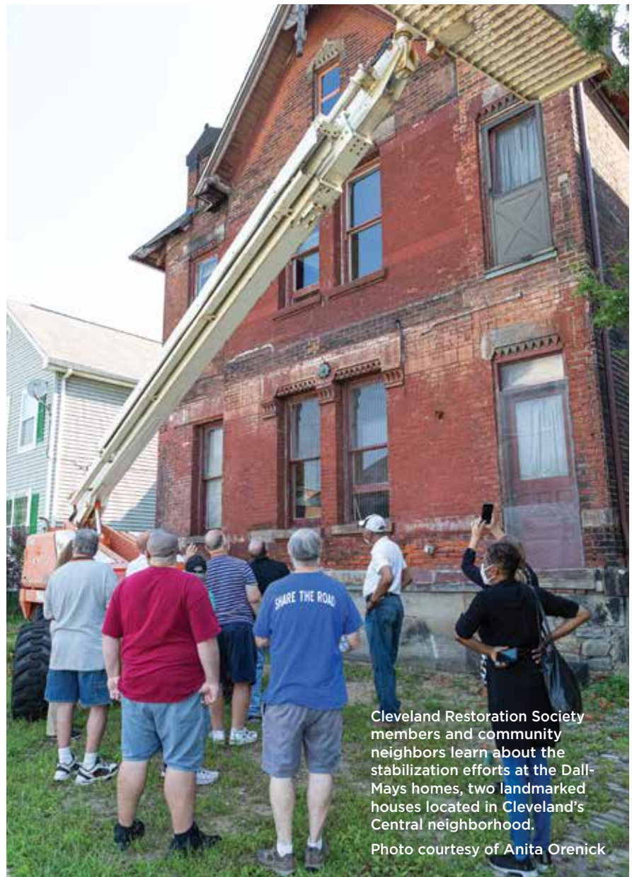
Cleveland Restoration Society members and community neighbors learn about the stabilization efforts at the Dall-Mays homes, two landmarked houses located in Cleveland's Central neighborhood.

“In our 50th year, we recognize the dramatic impact preservation has had on the community and the significant work yet to be accomplished.”