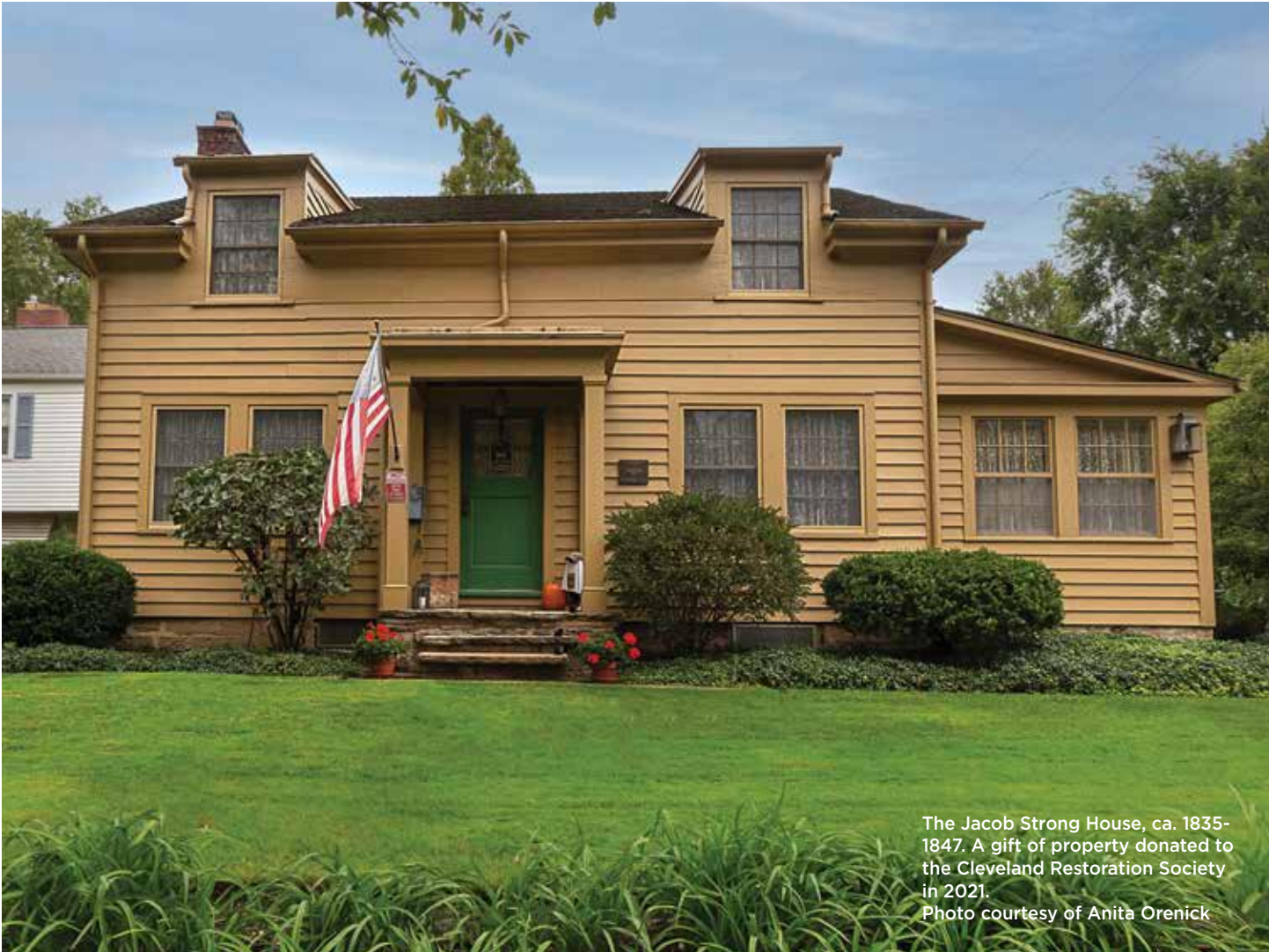
The Jacob Strong House, ca. 1835-1847. A gift of property donated to the Cleveland Restoration Society in 2021.